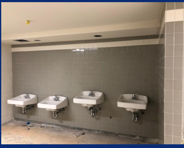
Ceramic tile and lavatories installed in lower level gang restrooms