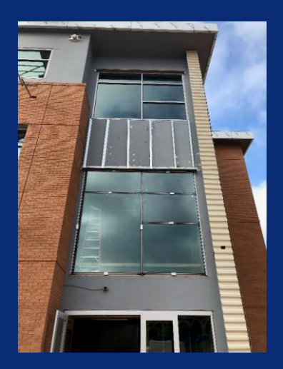
Storefront and curtainwall in progress on west stair