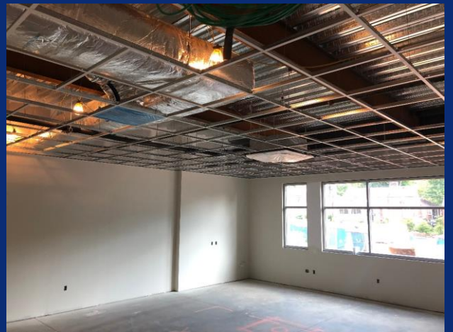
Prime paint and grid installed through main east (Kindergarten Rm 276)