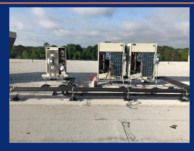
VRV refrigerant lines run and pressure testing in progress