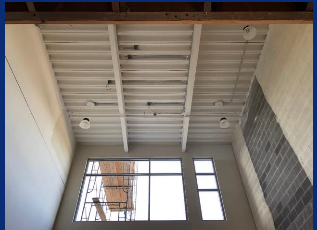
Dryfall and permanent lighting in progress over C1-1 stairs