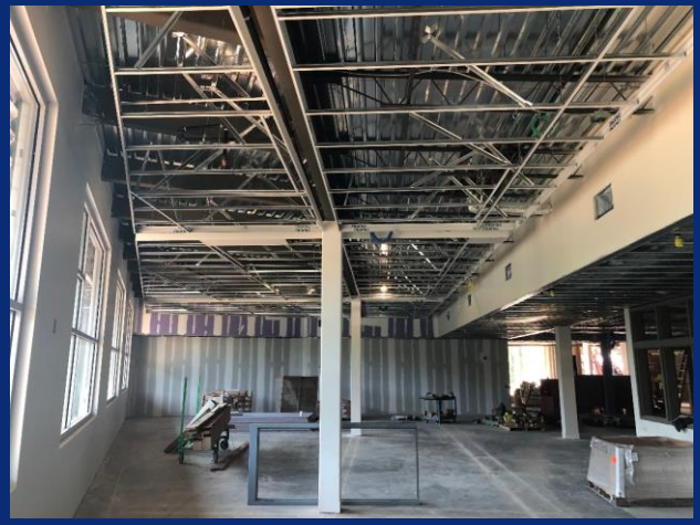
ACT cloud grid installed in media center