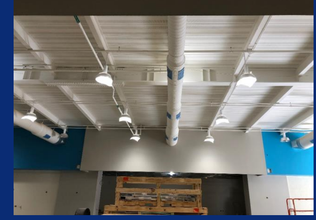
First coat finish accent paint in gymnasium