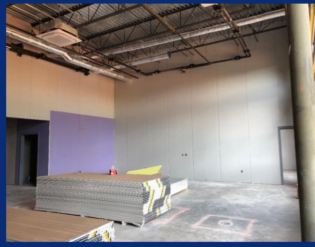
2<sup>nd</sup> floor east topped out (Band Rm 373)