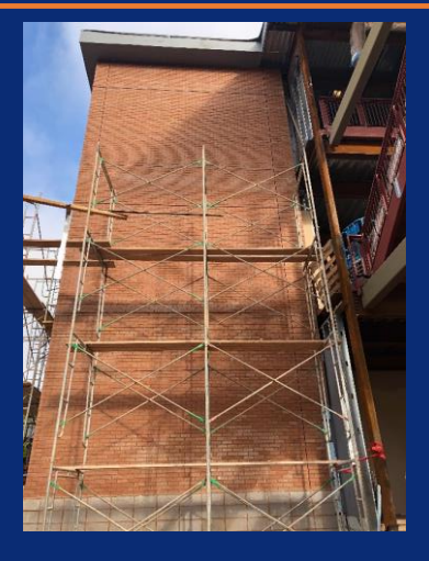
Brick topped out on Elevation J in vicinity of South Stairs