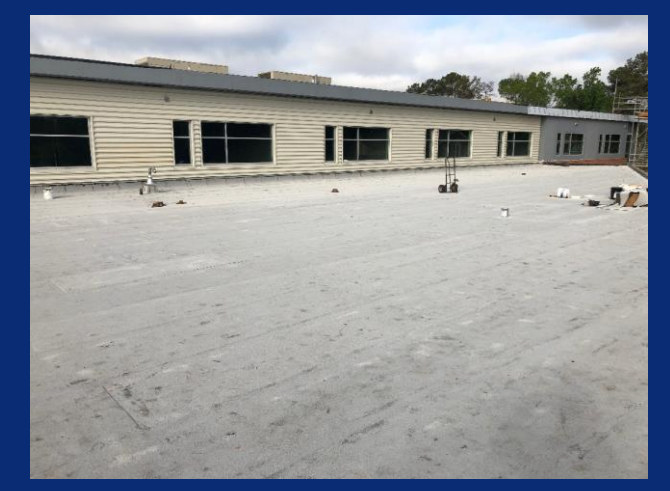
Roof 4 final layers complete (over media center)