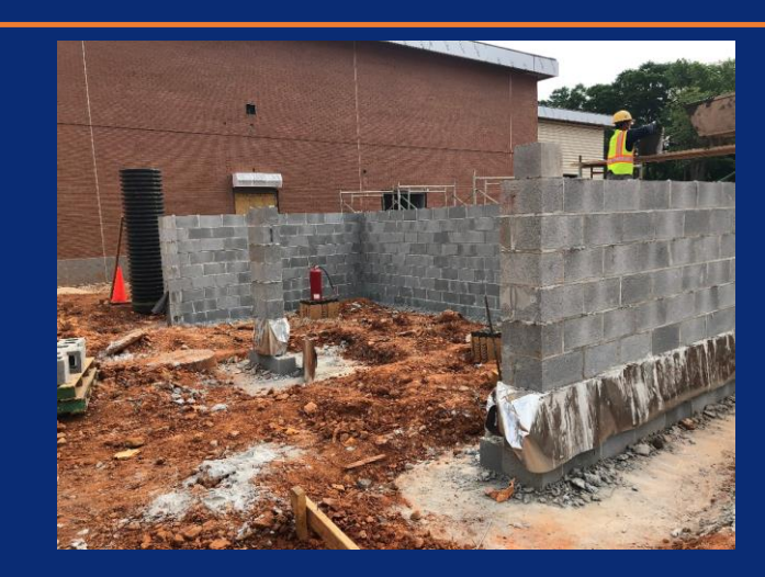
Dumpster enclosure in progress